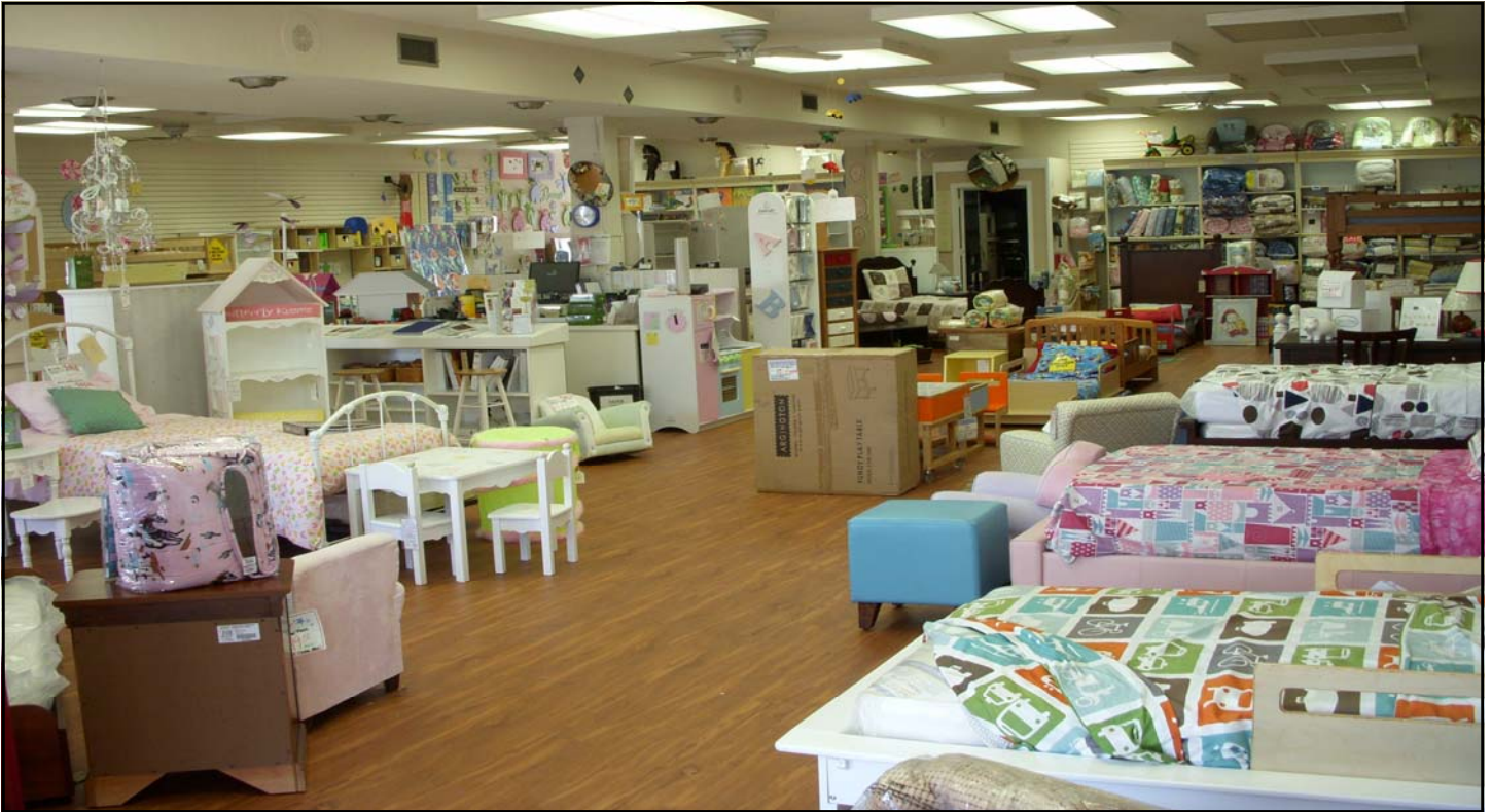
Interior Building Photo